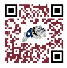
Sign Up Required

Unsportsmanlike conduct, e.g., disrespectfully addressing an official, illegal throws, profanity, taunting, using insulting or vulgar language or gestures, contact with an official, or fighting, results in disqualification.