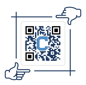
Sign Up Required