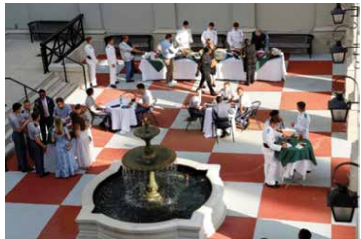
The first guests arrive in Capers courtyard to celebrate the GSJAC.