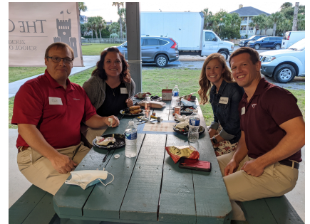
Meet and Greet, 2020