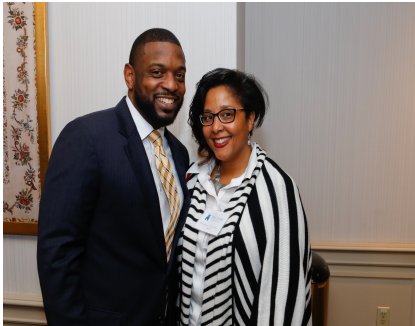
Wall of Fame