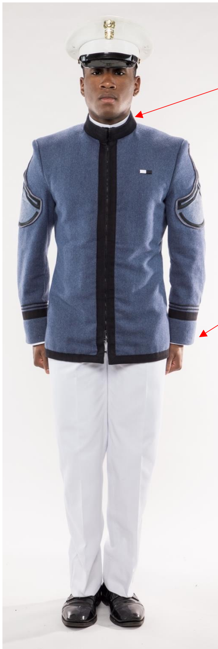
Dress Salt and Pepper