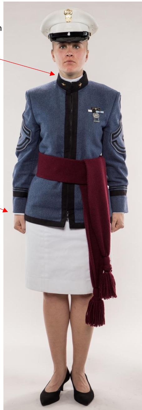
Dress Salt and Pepper with Sash and White Skirt

White collar- 1/8 in exposed, no more than 1/2 in overlap in front