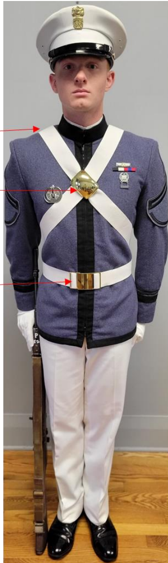
Under Arms Rifle-Front

Waist belt horizontal with waist plate centered on black braid on dress coat