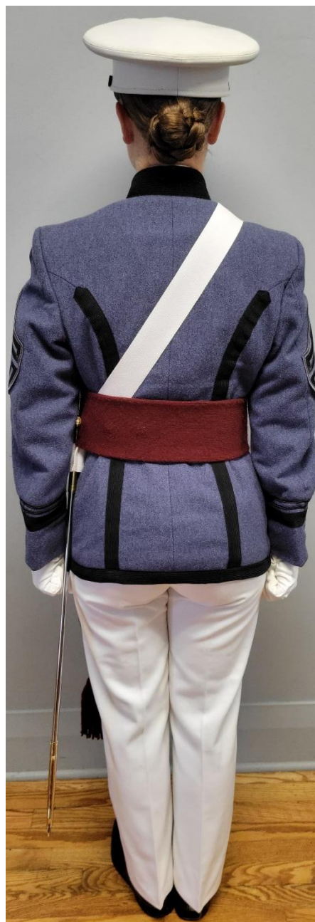
Under Arms Sword, Dress Salt And Pepper