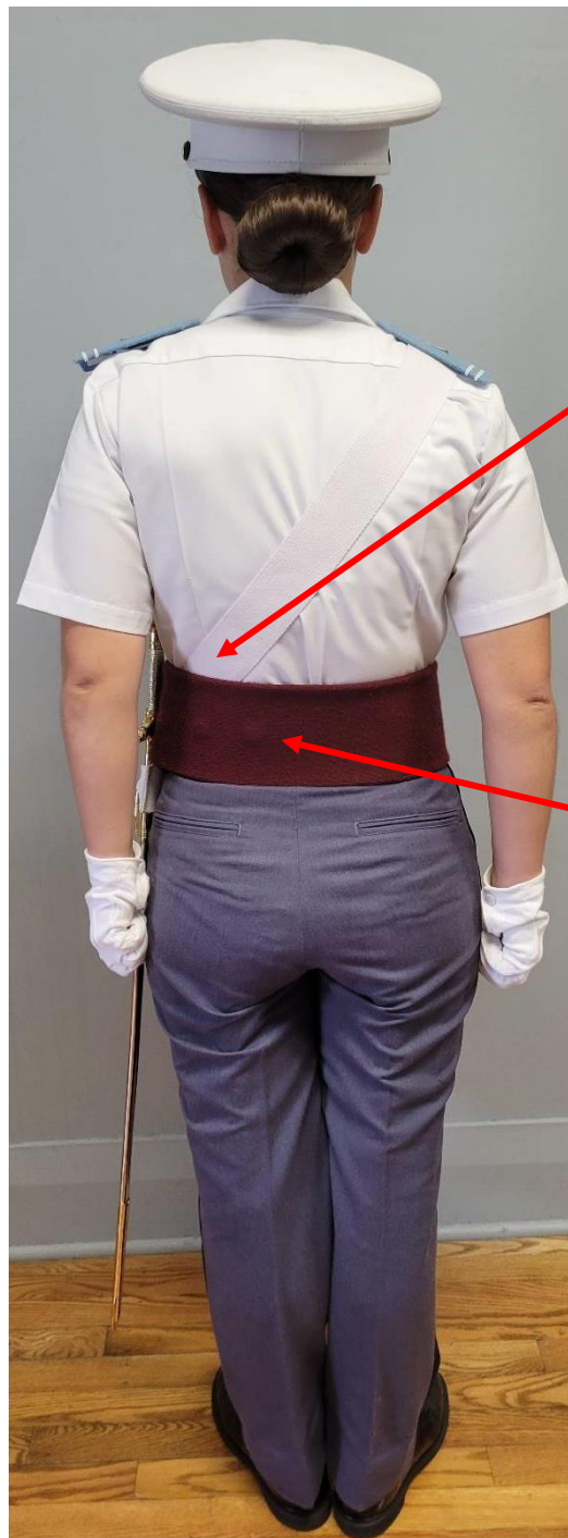
Summer Leave, Under Arms with Sword