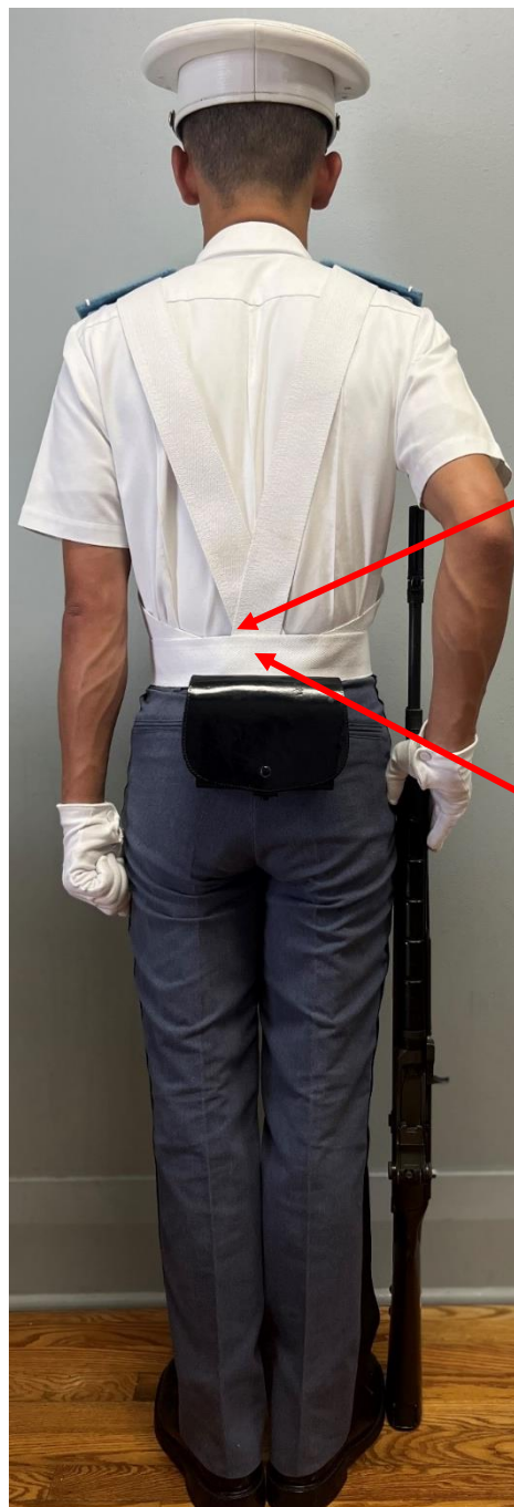
Summer Leave, Under Arms with Rifle

Cartridge box parallel to waist belt, top flush with bottom edge of waist belt