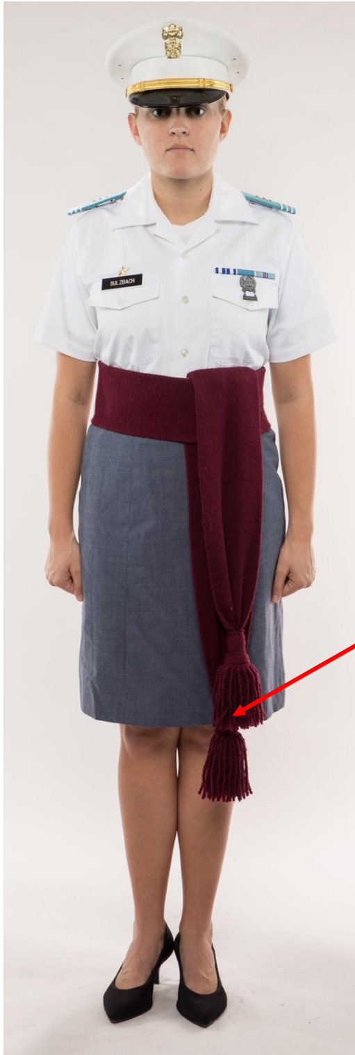
Summer Leave, Gray Skirt with Sash

Drill Master badge centered on wearers right pocket