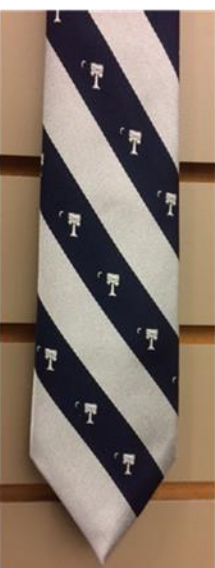
Blue & Gray Stripes