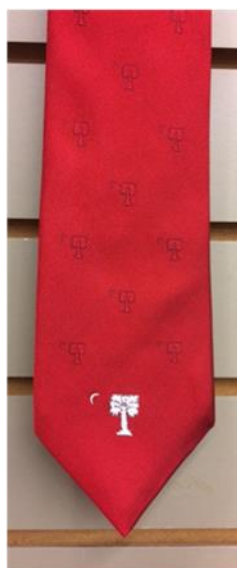
Red w/ Palmetto Moon