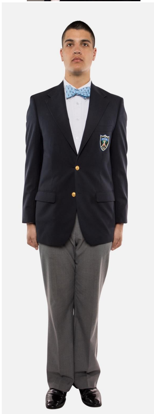
Male Blazer with Bow Tie