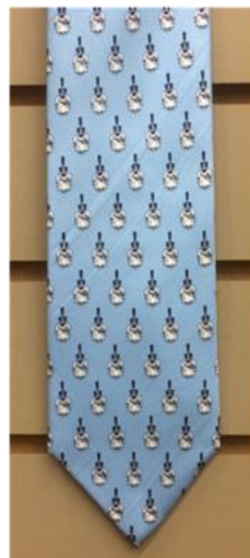
Blue w/ Mascot