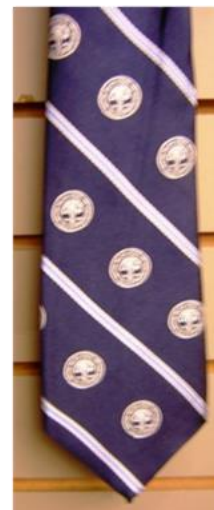
Dark Blue w/ Citadel Seal