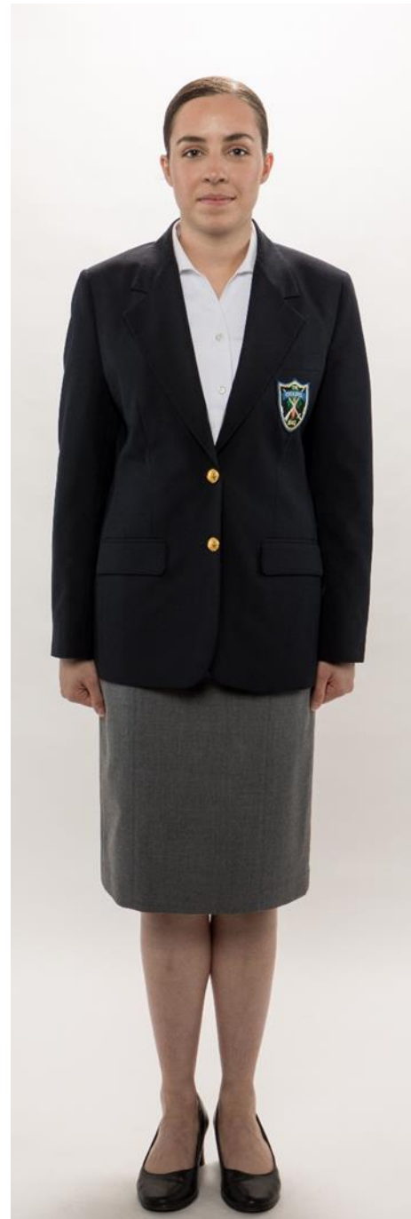
Female Blazer with Skirt