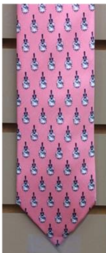
Pink w/ Mascot