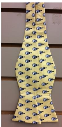
Yellow Bow-tie w/ Mascot