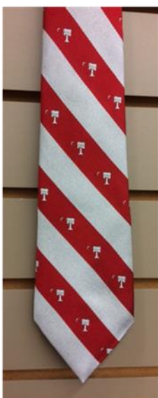
Red & Gray Stripes