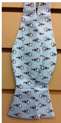
Blue Bow-tie w/ Mascot