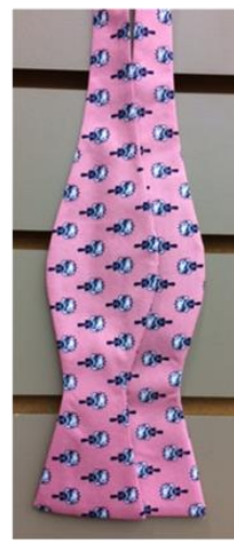
Pink Bow-tie w/ Mascot