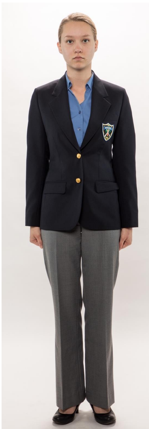
Female Blazer with Pants