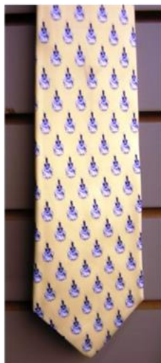
Yellow w/ Mascot