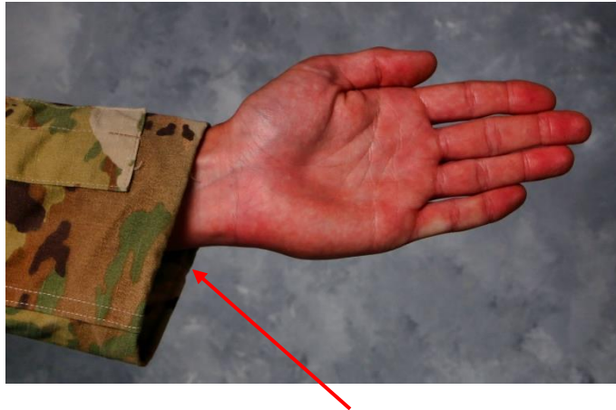
Unauthorized cuffed sleeve