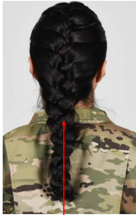
Braid is centered and does not fall Below shoulder blades