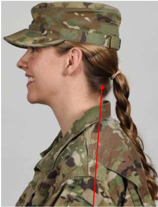
Braid does not interfere with Proper wear of cap