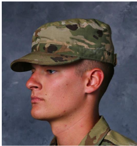
OCP Patrol Cap