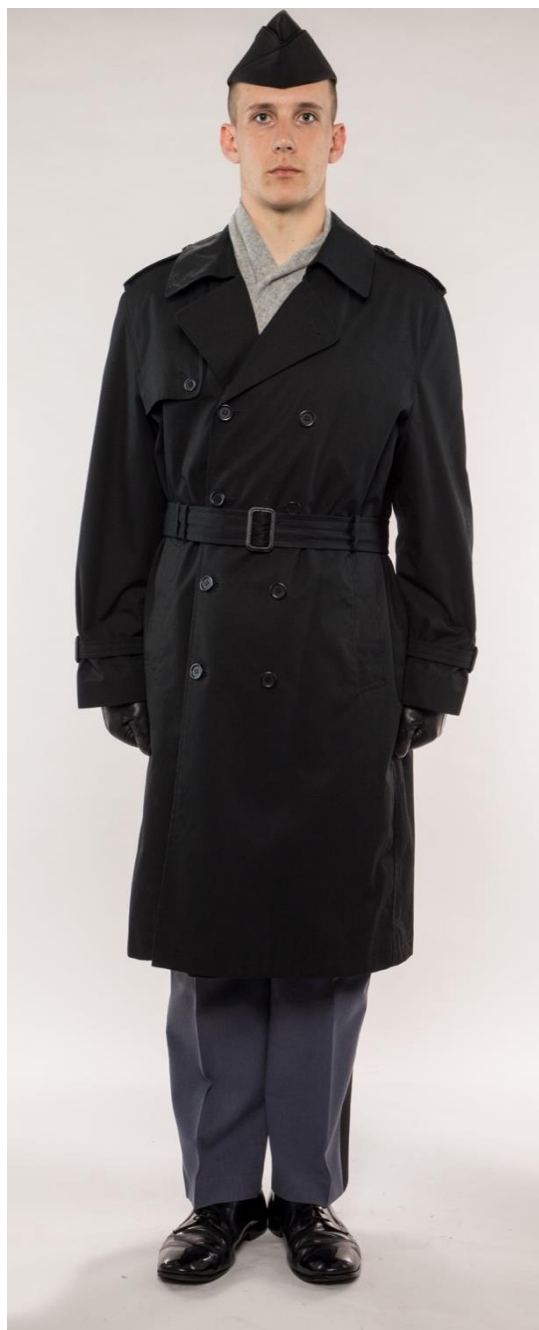
Black All-Weather Coat