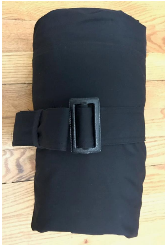
Black all weather coat with liner rolled for

5. Rolling Coat for Carrying: The coat will be rolled neatly and secured with the belt when carried.