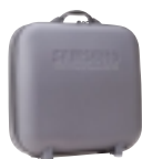
: BAG-950 Deluxe carrying bag