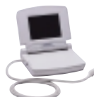
: LCD-5500 You can preview your presentation.