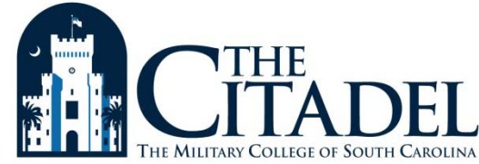
Campus Utility Consumption